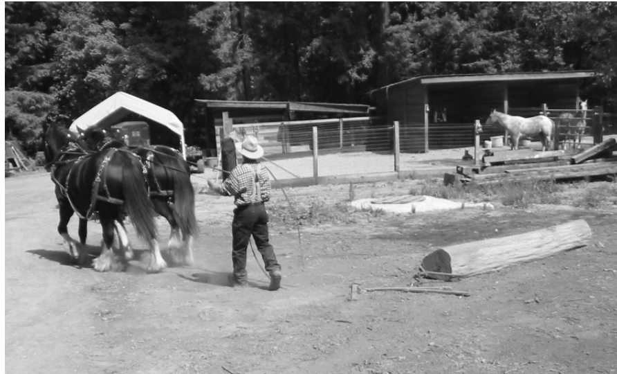
Horsepower at Sturgeon's Mill

The final Chapter event, the annual meeting held at the Computer History Museum in Mountain View, CA was sparsely attended. Members did get a chance to see some of the largest collection of computer related materials in the world. One of the most significant artifacts is a panel from the Eniac, the first electronic digital computer. There is also a collection of supercomputers designed by Seymour Cray, one of the most influential figures in supercomputer design.